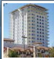
16-Story Condo Tower